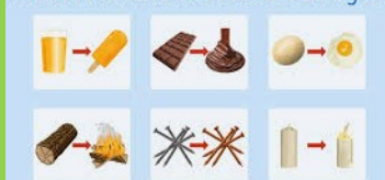
Reversible and Irreversible Changes

This term, we will be looking at materials including sorting different types, dissolving and evaporating solutions, irreversible and reversible changes.