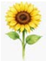
We planted sunflower seeds