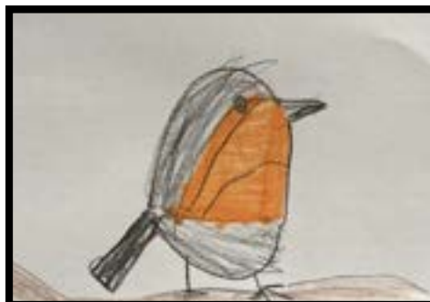
What hatches from an egg!

Reception have been working hard both inside and outside the classroom- exploring and learning about the world around them.