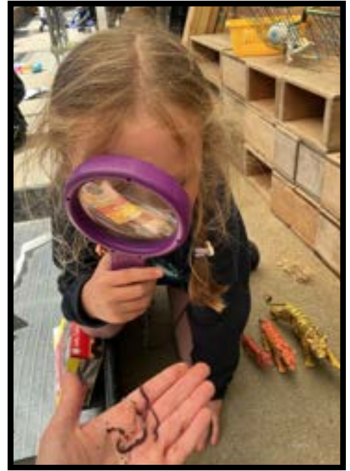
Finding worms in our outside area.