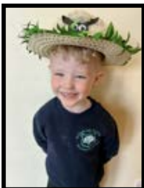
Easter Bonnet winner RSM.