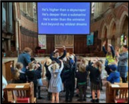
Singing—Our God is a Great Big God!