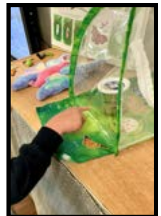
The caterpillars are wiggling!