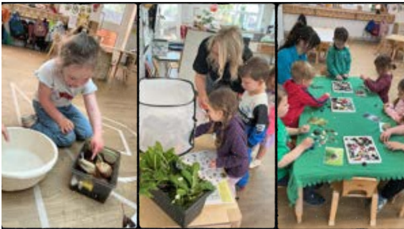
African land snail Feeding the bugs Making our own minibeast

It's been a joyful, hands-on topic full of wonder, discovery and brilliant early learning.