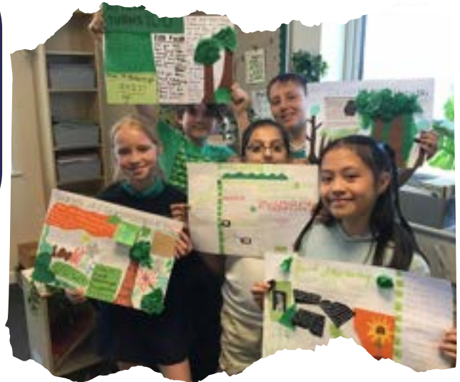
Year 5 made posters

Children came dressed in green, animal print, or anything inspired by the natural world. Lots of fun activities were planned for the day, helping everyone learn more about wildlife and how we can look after our planet.