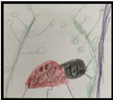
Beautiful ladybird hatches from its egg.

Reception have been working hard both inside and outside the classroom- exploring and learning about the world around them.