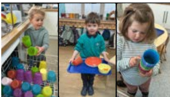
Helping out in the Nursery