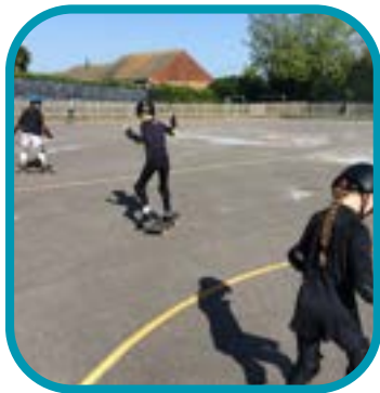
Skateboarding begins again!

We have been making electrical games using buzzers. We started our learning by playing some different electrical component games.