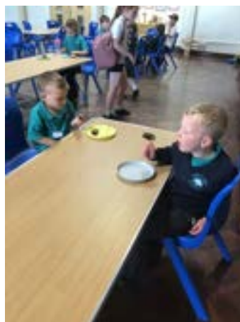
Time to eat!

We love coming to SPLASH as we do lots of fun 'stuff' and play with our friends!