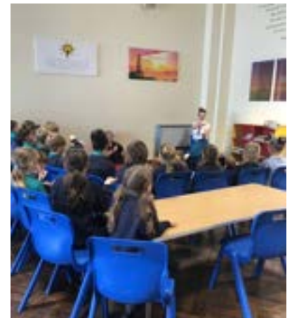
Learning to sign

We love coming to SPLASH as we do lots of fun 'stuff' and play with our friends!