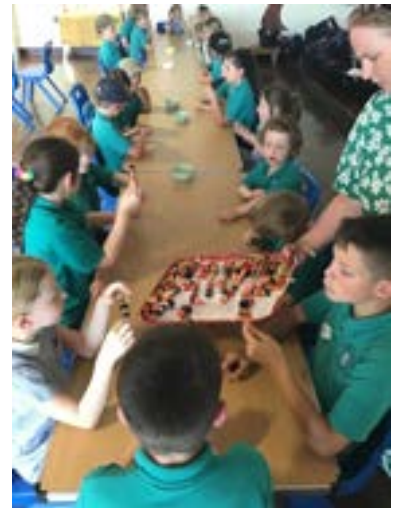
Tasting fruit kebabs