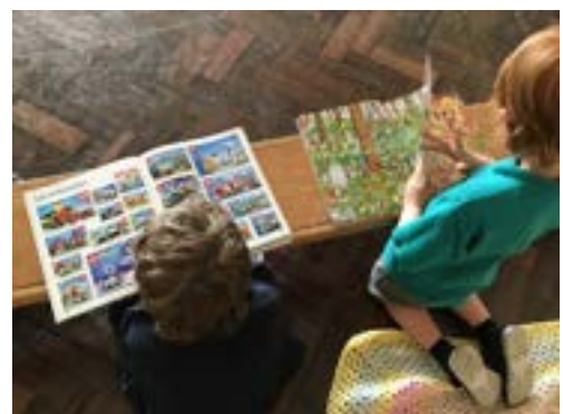
Enjoying a book