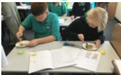
DT cereal bar project