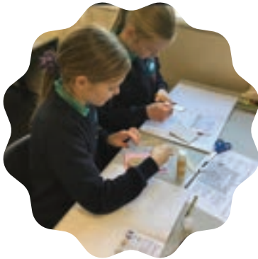
Fun at the museum