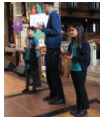
3 Christmas Gifts