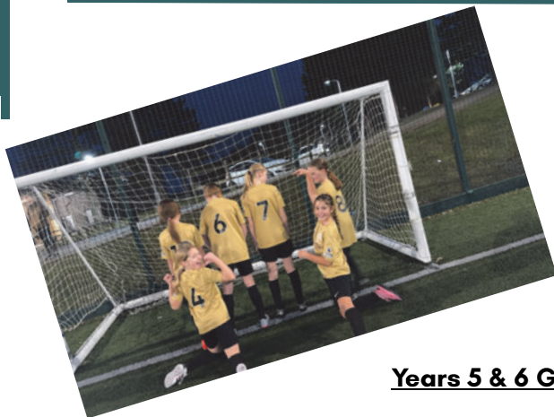
Years 5 & 6 Girls' Football Team