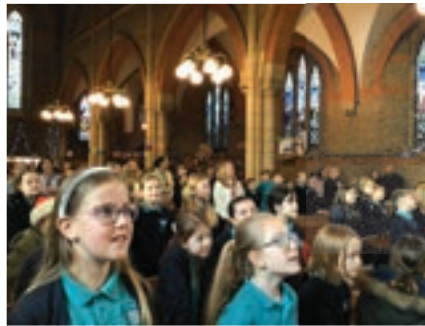
Years 4,5 & 6

I was nervous as I had to do a last minute reading because someone was away. Reader-Elsa- 6ECM