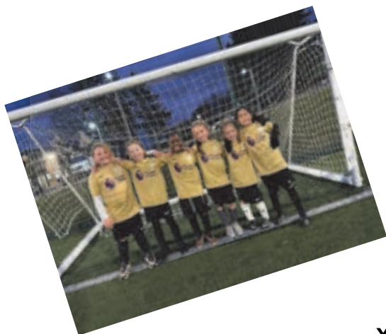
Years 3 & 4 Girls' Football Team