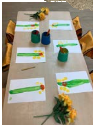
Mother's Day-Daffodil painting-