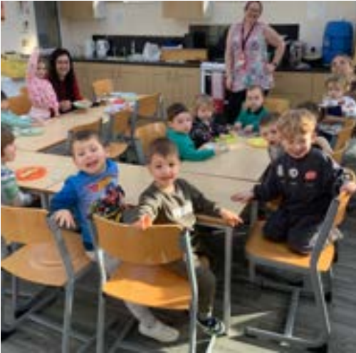
Enjoying our delicious pancakes

It has been a wonderfully busy few weeks in Nursery, filled with learning, creativity and lots of family involvement.